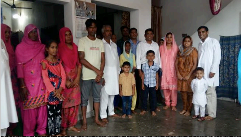
Members of Pastor Edwin's church who were baptized, and their families.

After baptisms at Pastor Edwin's church, they traveled to the sight of one of the new wells in southern India. The villagers claim that the pump works smoothly, and the water tastes good and fresh. They are planning to build a prayer house near the well site for the growing church family.